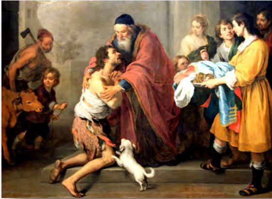
The Return of the Prodigal Son

* 4 th Sunday of Lent | March 27 th , 2022 *