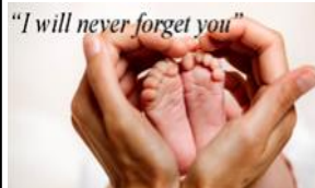
"I will never forget you"

The Char Deslippe Memorial Award ($500): for a teacher working in Catholic Island Schools or a parish catechist serving in children, youth or adult ministry. https://www.rcdvictoria.org/char-deslippe-award