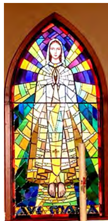
Image: Window in Our Lady of the Rosary Church, Langford, BC

May is always a month dedicated to our Blessed Mother Mary.