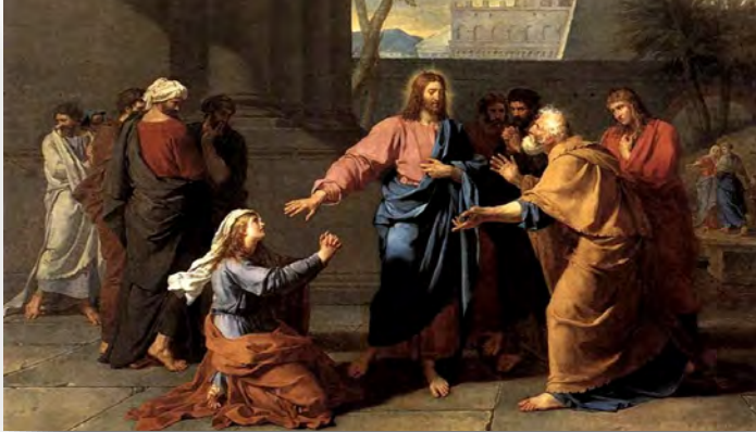
The Woman of Canaan at the Feet of Christ, by Jean-Germain Drouais (1763-1788), painted in 1784 Oil on canvas

* 5 th Sunday of Lent | April 3 rd , 2022 *