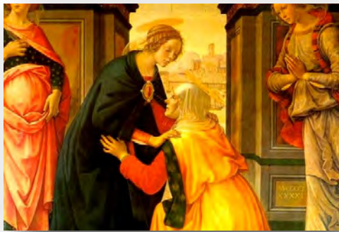
The Visitation, by Domenico Ghirlandaio (1491)

“Blessed are you among women, and blessed is the fruit of your womb.”