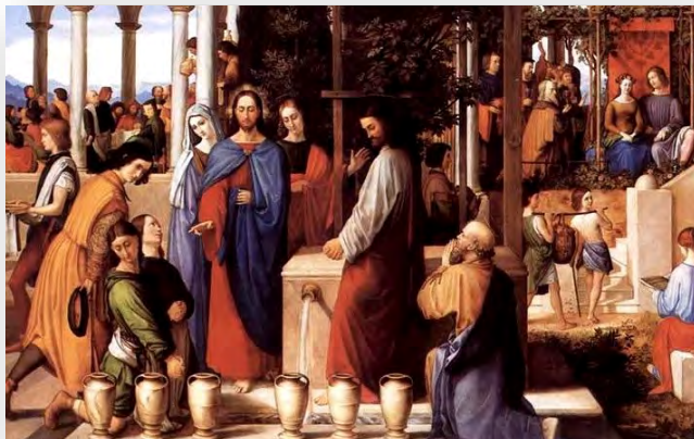
Wedding at Cana

* 2 nd Sunday in Ordinary Time | January 16 th , 2022 *