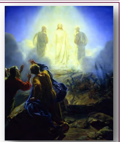
Transfiguration of Jesus by Carl Heinrich Bloch (1872) The National Historic Museum at Frederiksborg Castle

Our intention to follow Christ must be genuine and not superficial. In today's second reading Paul writes to the Philippians, criticizing those who appear righteous in following the laws but ultimately lack a moral compass. Paul offers hope, promising that human weakness will be "conformed to the body of [Christ's] glory." He encourages the Philippians to imitate Him and