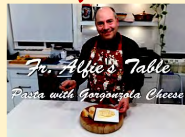
Pasta with Gorgonzola Cheese.