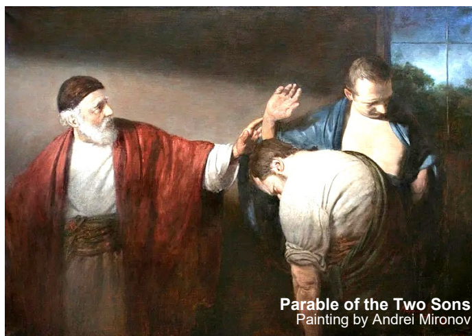
Parable of the Two Sons Painting by Andrei Mironov